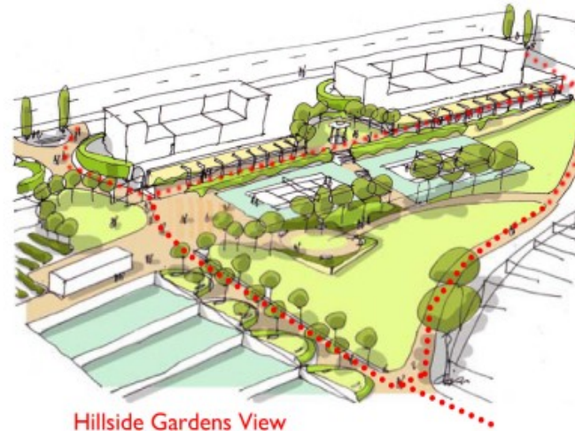
Hillside Gardens View